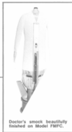
Doctor's smock beautifully finished on Model FMFC.

FOR THOSE WHO WANT ADDED CONTROL WITH- IN THE BAG . . . and less to do outside the form.